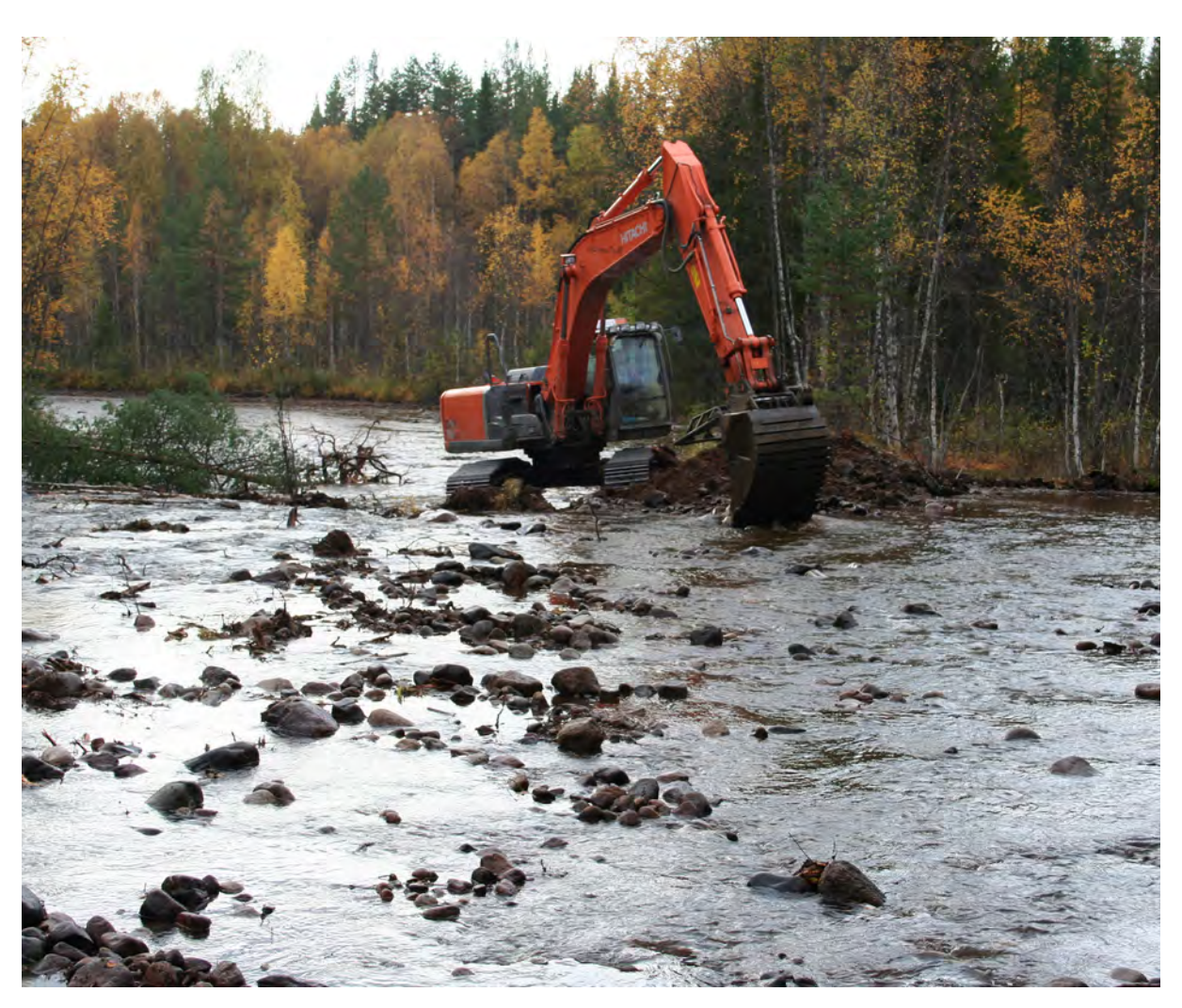
The work with removing migration barriers and improving the conservation status of the species and habitat targeted by Remibar will continue in a range of projects and partnerships.

As shown above, the knowledge and methods acquired during the course of Remibar are being used in a range of projects within the counties of Norrbotten and Västerbotten. They are also being disseminated to stakeholders in others parts of Sweden and neighbouring countries. The work aiming at improving the status of habitat and species in the five rivers included in Remibar is also being continued within the scope of a range of other ongoing and planned projects.