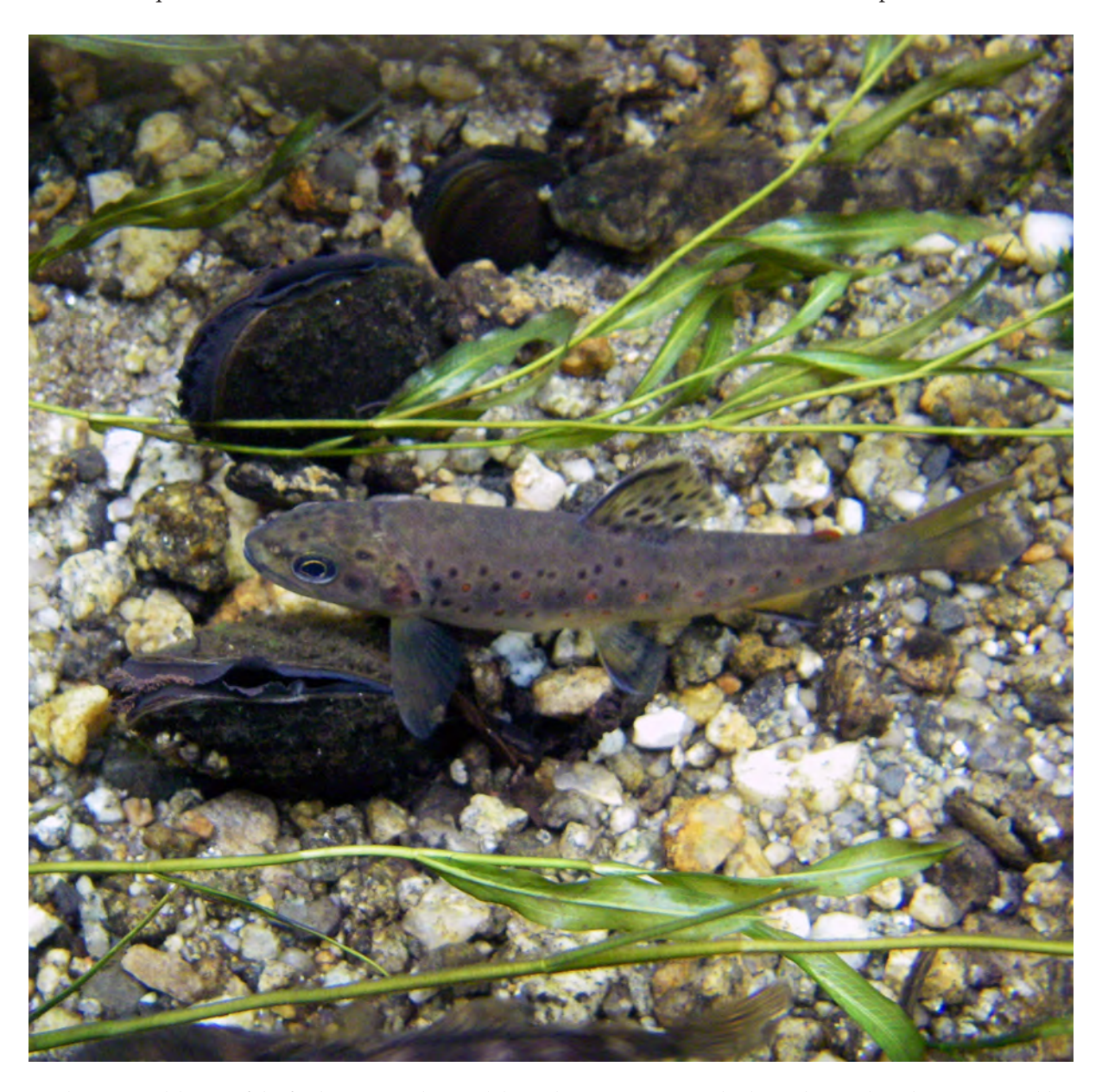
For their survival, larvae of the freshwater pearl mussel depend on young trout and salmon that are less than one year old.

In the counties of Norrbotten and Västerbotten, new nature reserves are being established in order to protect valuable habitat in the region. The legal protection of these areas encompasses the land areas as well as the aquatic environment. The establishment of nature reserves is a continuous process.