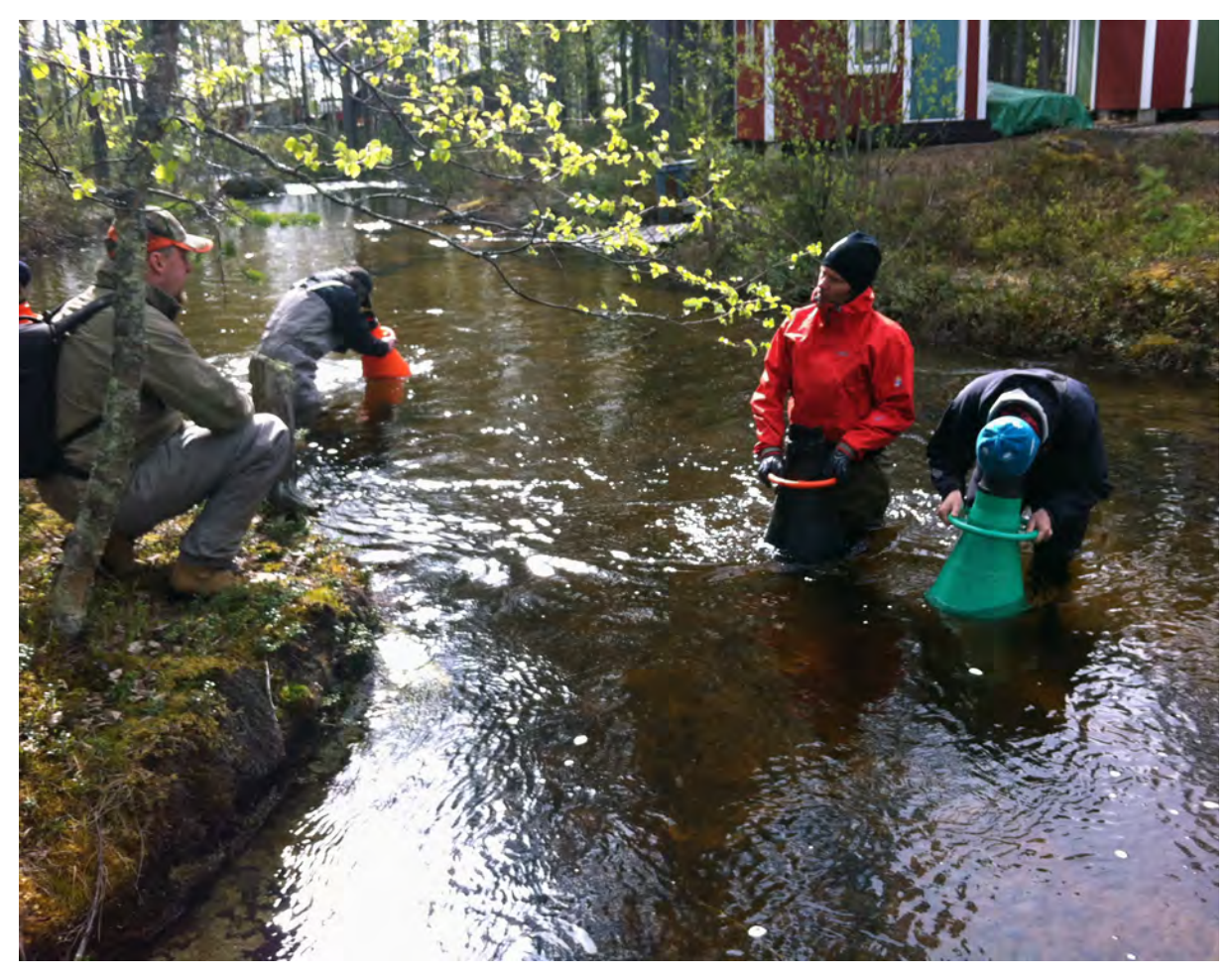
The work will continue to spread knowledge about freshwater pearl mussels to landowners.