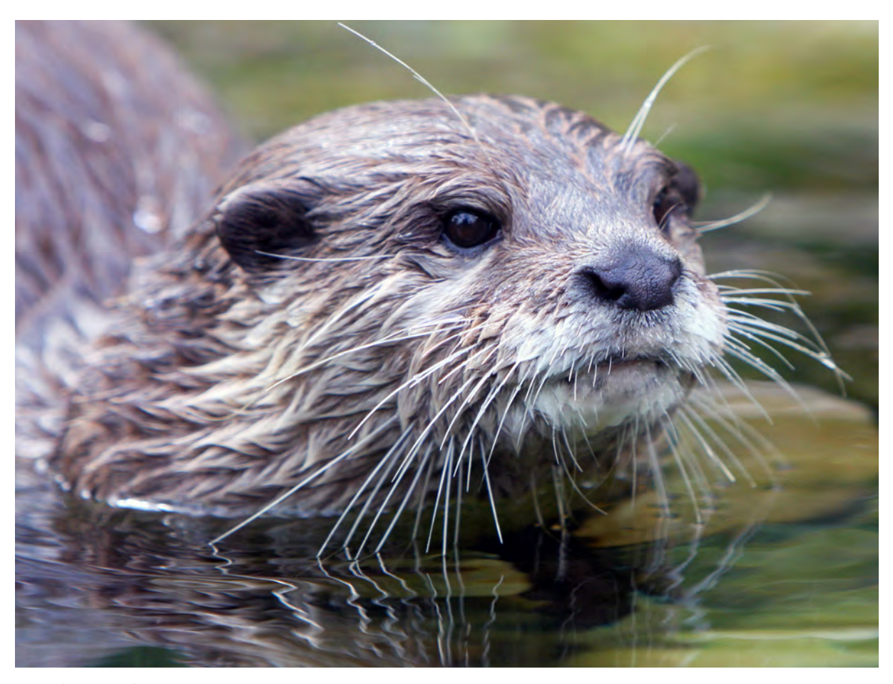
Otter (Lutra lutra).