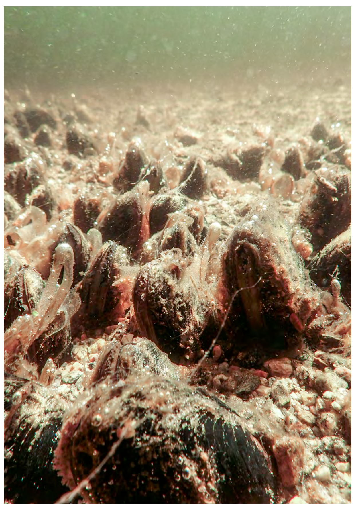
The freshwater pearl mussel monitoring programme is part of a national monitoring programme targeting unionids. The objective of the monitoring is to assess recruitment, the genetic variation within the populations, the threats to different populations, the conservation status of different populations, the ecological and chemical status of its habitat, and need for action.