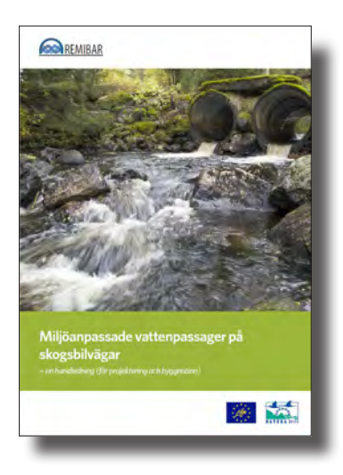
In order to make information regarding "best practices" available for a broader audience, a manual was written.

stream crossings for forest roads – a guide for planning and construction" (Lindström-Jönsson et al., 2014). The manual was produced within the scope of Remibar as a joint project between the STA, the SWAM, the SFA, forestry agencies, and the CABs of Norrbotten and Västerbotten, among others. The manual will continue to be used by road construction companies and road owners and is available for download on the website of the STA. The STA will continue the effort to spread knowledge about best practices regarding the construction of roads in road-river crossings in their everyday work. It will also be part of other projects focusing on the restoration of river habitat and connectivity, such as ReBorN LIFE (Restoration of Boreal Nordic Rivers) which will be running from 2016 to 2021. (Further details regarding ReBorN below). The County Boards of Norrbotten and Västerbotten continue to actively promote the methods developed regarding the design and construction of road-river crossings. When receiving visitors from other agencies, from other parts of Sweden, or foreign governments, a trip to some of the demonstration sites is often part of the visitors' program.