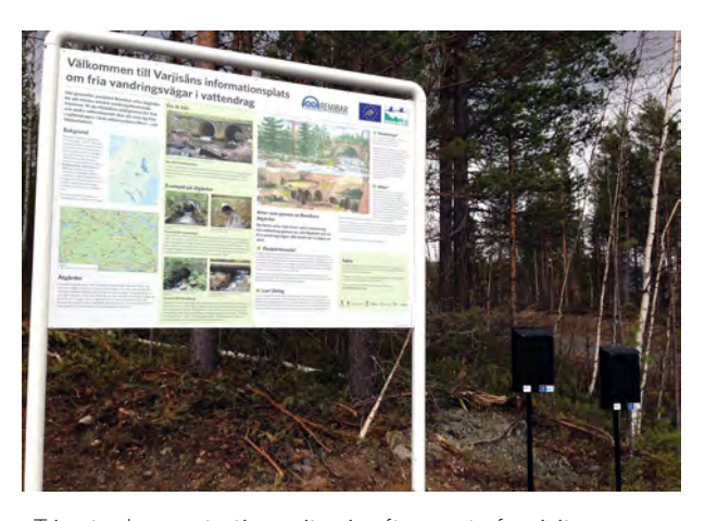
Trips to demonstrations sites is often part of a visitors program.

Throughout the course of Remibar, in order to increase the knowledge about migration barriers, road owners and companies involved in the construction of roads were informed about the role of bridges and culverts as migration barriers and their potential negative impact on the connectivity of the aquatic environment. Information regarding different designs that would reduce the negative impact on the aquatic environment was disseminated through meetings, information material and demonstration sites. In order to make information regarding "best practices" available for a broader audience, a manual was written with the title "Ecologically adapted