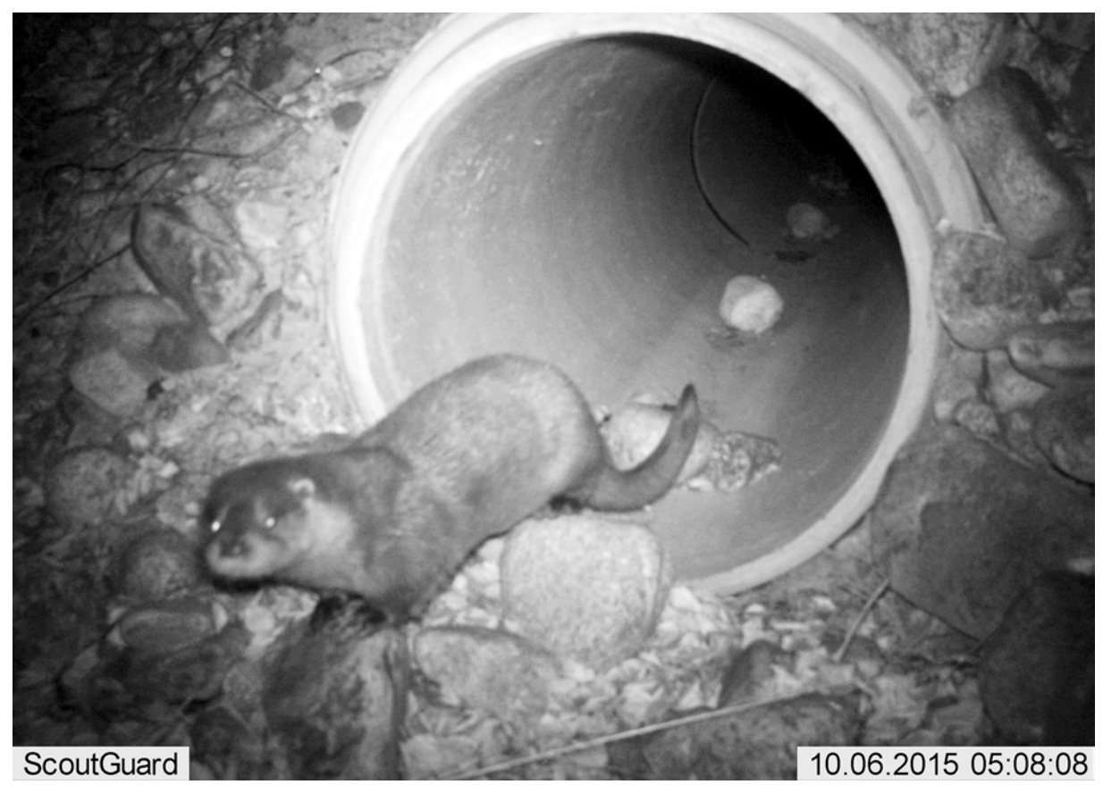
{\it Camera\ monitoring\ revealed\ that\ otters\ had\ used\ five\ of\ the\ underpasses.}