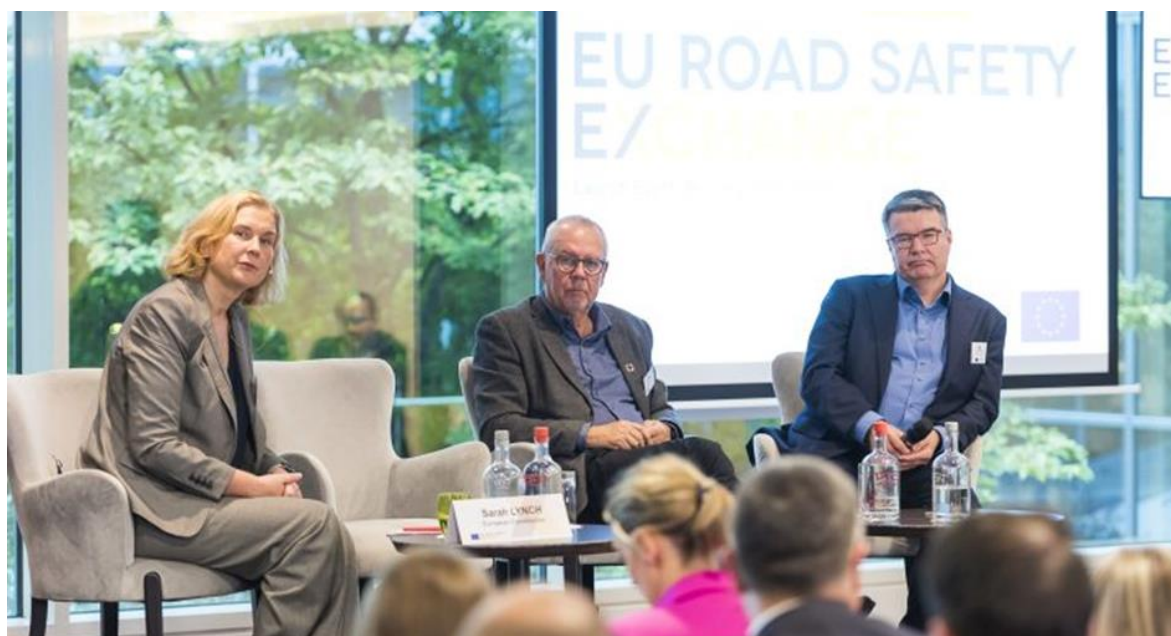
EU Road Safety Exchange

The Swedish Transport Administration is an active member of the European Transport Safety Council (ETSC). The road safety performance differs greatly amongst the EU member states, and to address this issue and to exchange experiences across the EU member states and ETSC members, the EU Road Safety Exchange project has been running for a number of years. The project aims to help tackle disparities, linking up transport experts to exchange knowledge and good practice. The project is funded by the European Parliament and managed by the ETSC on behalf of the European Commission. In 2023, a new three-year phase of the project was launched and the official launch of the project took place in Brussels on October 18 th . During the launch event a study visit was organised, which allowed the participants to get insights into the road safety work in Brussels, with examples of successfully implemented road safety initiatives, such as a variety of traffic calming initiatives and other interventions which have generated a substantial reduction in road collisions in the city. A number of presentations on infrastructure safety, effective speed enforcement, the protection of vulnerable road users, and comprehensive collision investigation were also given by experts from participating countries from Spain, France, Finland and Sweden. Vision Zero Academy's expert Dr Lars Ekman was representing Sweden and the Swedish Transport Administration.