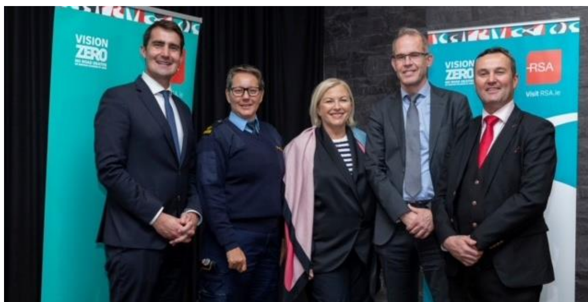
Irish RSA Road Safety Conference, Dublin

In the final remarks, Mr Sam Waide, Chief Executive at the Irish Road Safety Authority, highlighted among other things collaboration to reduce the number of fatalities and serious injuries in road traffic. He specifically mentioned the importance of speed and lowering the energy at our roads, and gave Norway's and Sweden's work with the Vision Zero and evidence-based approach to road safety as positive examples. Mr Jack Chambers, Minister of State at the Department of Transport, when closing the conference, highlighted the importance of commitment to end road fatalities and serious injuries and that there is a shared ambition across Europe to achieve the Vision Zero. The safe system and an evidence-based approach to road safety were emphasised by the Minister as important aspects.