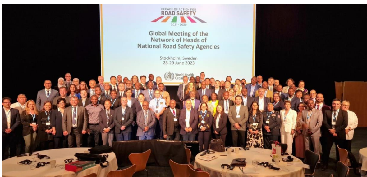
Heads of Road Safety Agencies

The two events in conjunction formed an "an international road safety week" in Stockholm, and the Vision Zero Academy is very happy that Sweden could host the first physical meeting in this newly started network. The meeting aimed to aid countries in implementing their road safety strategies in line with the Global Road Safety Plan 2021-2030. The network was launched following the United Nations High-Level Political Declaration on Global Road Safety in 2022, with the overall goal to aid countries to reduce road crash fatalities and injuries, in line with the global goal of halving these tragedies by 2030. In order to reach the ambitious global target, holistic, long-term efforts and systematic work from governments and societies is needed. The network aids governments and partners in establishing robust road safety policies, coordination systems and measures required to guarantee safe mobility for all citizens. It fosters collaboration and learning, seeks to provide technical and financial support, and monitors progress against the Global Plan.