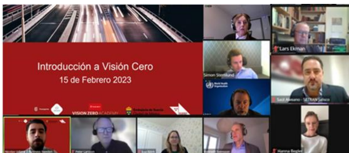
Vision Zero webinar Mexico

In February 2023, a webinar was organised on the Vision Zero for Jalisco, in collaboration with the Embassy of Sweden in Mexico and Business Sweden. It was targeted to strengthen the road safety management knowledge with participants from agencies involved in planning, designing, building, controlling and maintaining the mobility system in the State of Jalisco and municipalities from the metropolitan area of Guadalajara. Mexico in general, and the State of Jalisco in particular, are taking solid steps towards the adoption of the Safe System Approach. A number of road safety experts from the Swedish Transport Administration took part in the webinar and shared their knowledge on their respective areas of expertise with the participants from Jalisco. Also, the WHO participated.