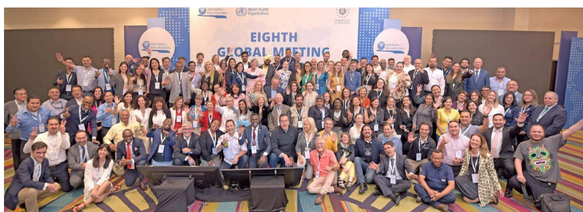
Global meeting 2023

In conjunction with the global meeting, a meeting of the United Nations Road Safety Collaboration (UNRSC) was held in the same venue, discussing among other things the plans for the global road safety week and the upcoming Global Meeting of Heads of Road Safety Agencies.