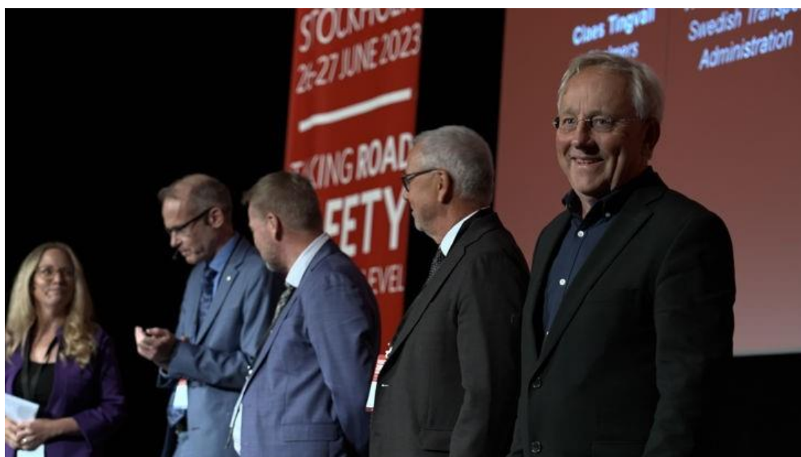
Programme committee VZC2023