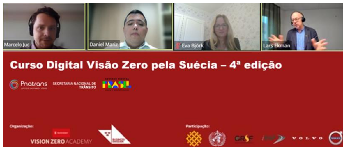
Fourth Vision Zero digital course for Brazil