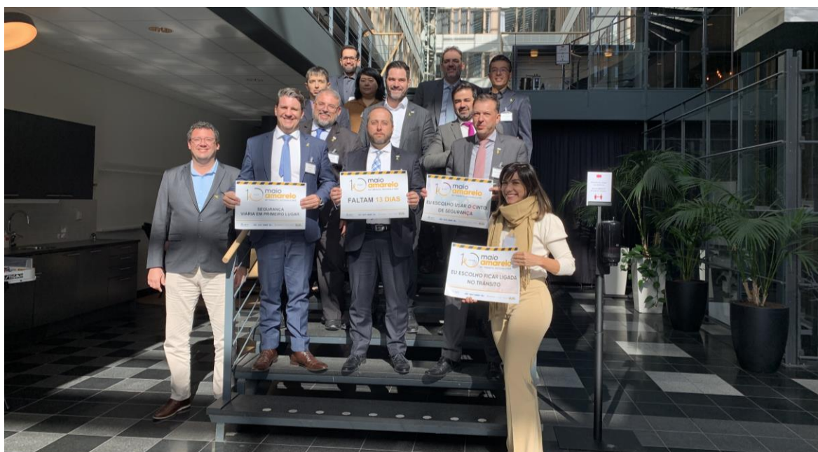
ANNT at Trafikverket

After the return to Brazil, ANTT organised a workshop to present the results and success stories that can be implemented in the Brazilian context. The visit took place under the framework of the International Technical Experience Program (PETI) which aims to promote international training for civil servants, in order to enable the expansion of technical knowledge, good practices and successful experiences.